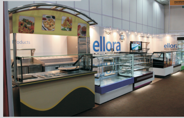
Glimpse of Bakery Expo